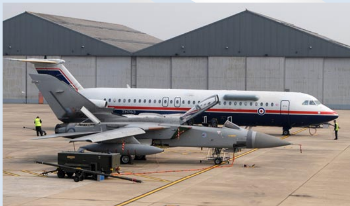
Figure 1: QinetiQ's Tornado and BAC 1-11 aircraft used during the surrogate UAV flight trials which used a dedicated Kontron multi form factor system based on 3U CompactPCI® and VME.

Working in combination, the Tornado and the four UAVs carried out a simulated ground attack on a moving target. The sophisticated system allowed the UAVs to act autonomously, communicate and sense their environment, including possible enemies, and target their weapons. However, the final decision to fire simulated weapons was retained by the Tornado pilot. The system has been designed to provide the UAVs with a significant degree of independent intelligence in order to minimise pilot workload, while at the same time ensuring that the most important decisions are retained by a human operator.