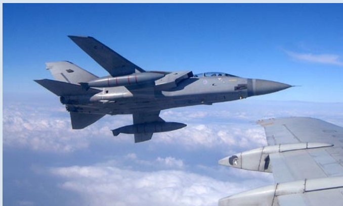
Figure 2: QinetiQ's Tornado Integrated Avionics Research Aircraft (TIARA) pictured from its BAC 1-11 which was acting as a surrogate UAV as part of the overall trial

Silent Servers (KISS-4U) with 3.2 GHz Intel® processors were also the optimal choice for reliable on-board operation.